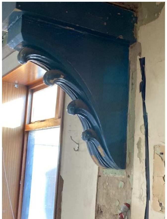
Corbels will be retained to showcase building's history