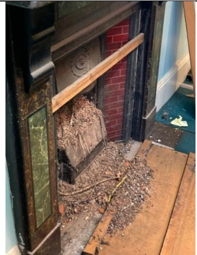
The curator's fireplace, top floor

The newly uncovered skylight in the atrium stairwell which now lets in so much more daylight drew admiration, though the disappointment that the barrel vaulted glass ceiling is most likely beyond saving and will not get a new lease of life was palpable. The plans to reinvigorate older spaces to new use and expand opportunities for the public to see the collections were well received. As the last few moveable items such as the cinema clock near the Woolhope Room doorway were removed from walls, small samples of original wallpapers were revealed and the possibility that these designs may be reinstated elsewhere raised a question. The once splendid Victorian fireplace in the curator's room on the top floor, recently uncovered by moving bookcases and plywood sheet, should be worthy of reinstating but not as a working fireplace. The corbels which serve as decoration rather than weight bearing on the iron girders may change location but will retain their place as artefacts in their own right. All unique in design they will grace the building and serve as reminders that some things are meant to last!