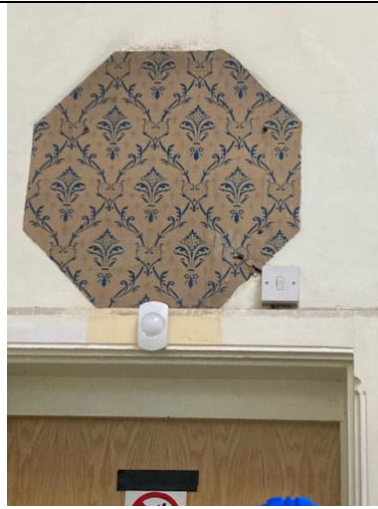
Original wallpaper outside the Woolhope Room