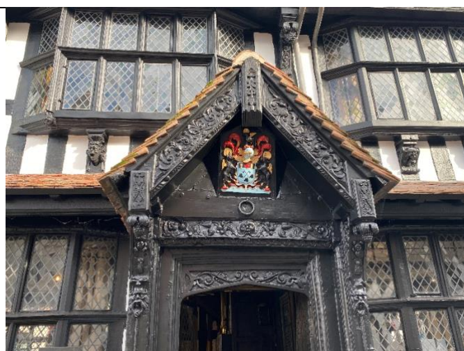
Magnificently repainted entrance

The company Splitlath have completed their work which included removing and replacing most of the modern interventions from the 1980/90s and replacing the lime mortars. The House is now looking resplendent minus the scaffolding clutter and with crisp new outside décor which highlights the carvings and heraldic symbols on the framework - things are definitely looking up for the House.