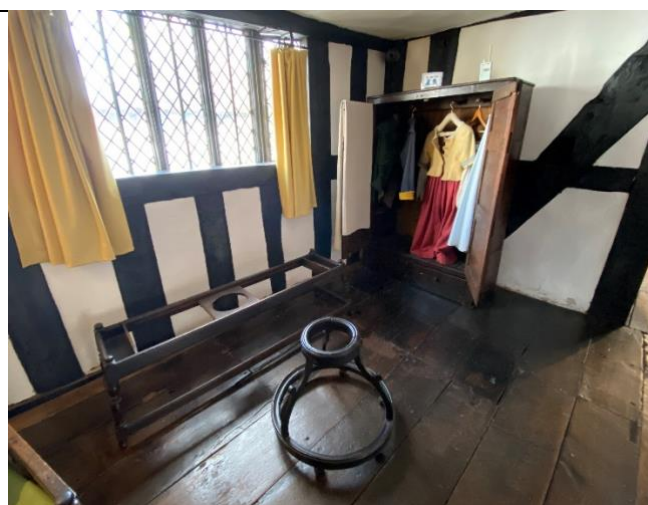
Childhood area, first floor. Dressing-up clothes are now on each floor.